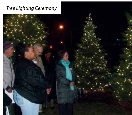
Tree Lighting Ceremony

Please join us as we honor those who passed away during 2014 with our annual ceremony. Refreshments and holiday cookies are served.