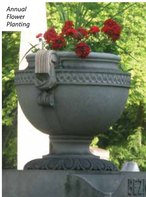
Annual Flower Planting

Our office staff will help you honor your father with a floral arrangement, if ordered by June 12th. Our office also will sell small bouquets for $10 on Friday and Saturday, June 13 and 14. You may come into the office or call and ask us to place the bouquet at your loved one's site. Quantities are limited.