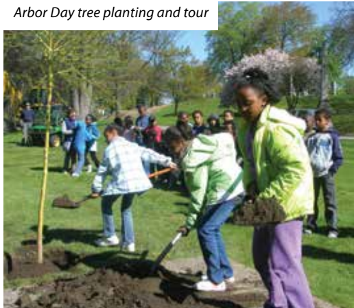
Arbor Day tree planting and tour

Join our grounds crew as we plant new trees along the western fence line in Section A.